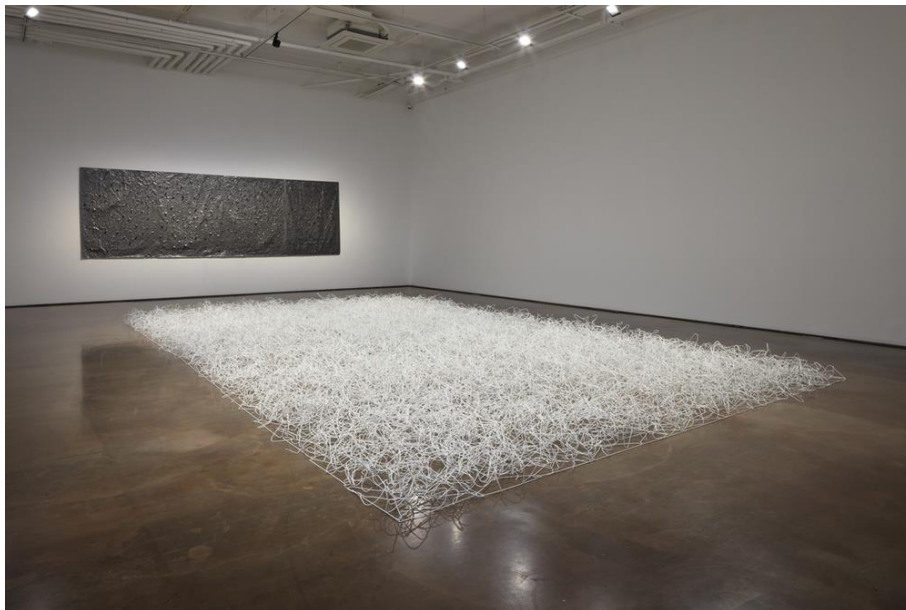
Untitled 016000 , 2016 (on the floor), Hangers, Dimensions variable, Installation: 730 x 430 cm (287.4 x 169.3 in.), ©Choi Byungso and Arario Gallery

A similar gesture is found in works by Choi such as Untitled 016000 , 2016 and Untitled 975000 , 1975 in which common objects – here clothes hangers and chairs - are used as media. Laying these out in new formations, and as an artwork, Choi allows the viewer to recapture the way in which they look at these everyday objects: refreshing the way in which the items are perceived.