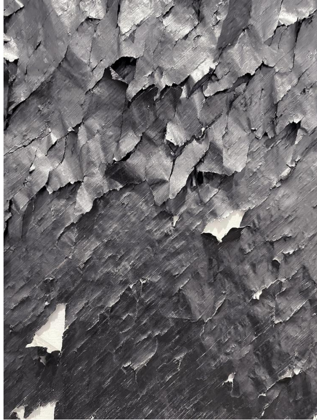
Detailed photograph of Untitled, 2019, Paper, ballpoint pen, pencil, 160 x 480 x 1 cm (63 x 189 x 0.4 in.), Four pieces

In the basement of Arario Gallery is Untitled, 2019, the largest work in the exhibition and which comprises four pieces of paper rendered in ballpoint pen and pencil, Choi's signature style. With graphite drawn over ink, again and again, the papers have acquired a metallic finish. From afar, the work resembles a series of thin steel sheets whose peeled-back edges are rough and sharp. On closer inspection, the papers remain fragile yet perfectly rigid: hardened by the continuous layering of pen and pencil. It felt important to look at Untitled first, even though it is not the first work in the exhibition, as it sets the tone and the scale of Choi's practice, where he takes knowledge and transforms the viewers understanding of it.