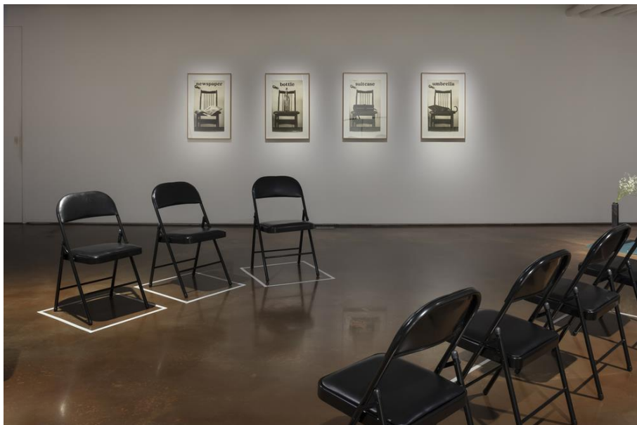
Untitled 975000 , 1975, Chair, masking tape, Dimensions variable, ©Choi Byungso and Arario Gallery